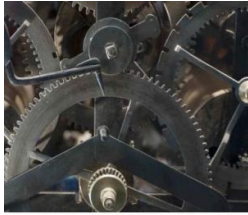
RECOVERY OF GOVERNMENT WASTE PAPER