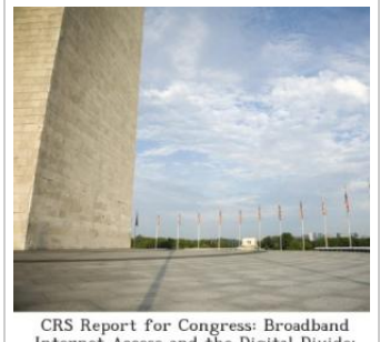
CRS Report for Congress: Broadband Internet Access and the Digital Divide: Federal Assistance Programs: June 27, 2002 - RL30719