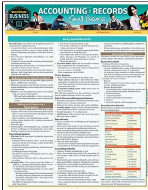
Filesize: 1.38 MB