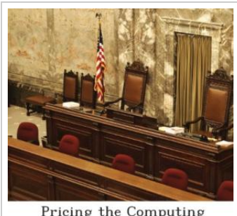
Pricing the Computing Resources: Reading Between the Lines and Beyond