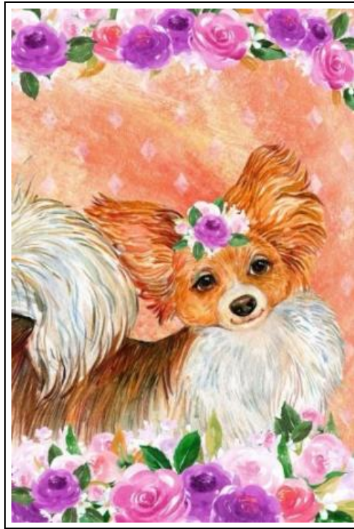
Filesize: 3.78 MB