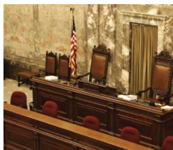
ED466 025 - U.S. Department of Education Strategic Plan, 2002-2007