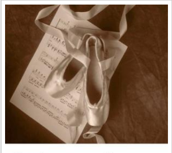
THE LUTHERAN HYMNARY

Hauge's Evangelical Lutheran Synod, Norwegian Evangelical Lutheran Church Of America