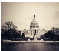
S. Hrg. 112: Department of Homeland Security Appropriations for Fiscal Year 2012