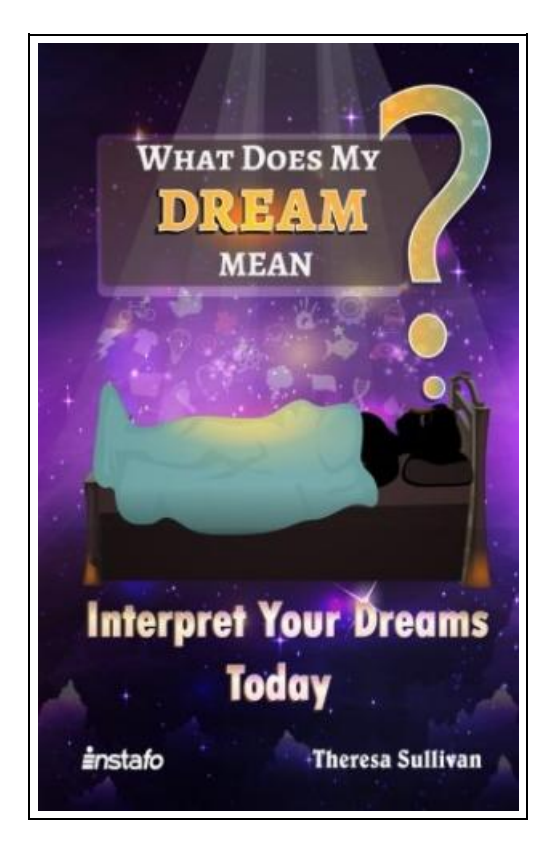
Filesize: 5.8 MB