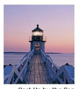
Cast Up by the Sea